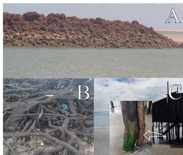
Figure 2. Examples of sampled substrates. A – Rocky outcrop (maximum height about 1 m) at Atalaia beach during the low tide; B – Roots and branches of Laguncularia racemosa at Marudá beach; C – Crispim beach, with civil constructions as substrata for Pseudorhizoclonium africanum .

Sampling was performed during the low tide, at the midlittoral sector of the beaches. The algae were removed